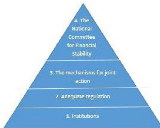
Figure 1: Pyramid of financial stability